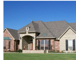
FROM THE TEXAS HILL COUNTRY, WE FIND THE BEAUTY OF LIMESTONE.