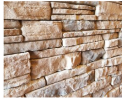
MT. LEDGE QUICKFIT- ROCKY MT. BLEND