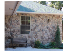
DEEPLY TEXTURED, NATIVE FIELDSTONE ADDS A TRADITIONAL TOUCH.

WWW.PEMASADI.COM INFO@PEMASADI.COM / (407) 433 6619