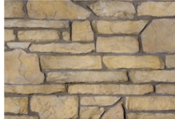
FRENCH COUNTRY- BUTTER CREAM