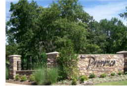
FRENCH COUNTRY IS A UNIQUE STONE BLEND THAT GIVES YOU THE QUAIN ELEGANCE OF A FRENCH CHATEAU.