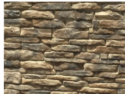
LEDGESTONE - AZTEC BROWN