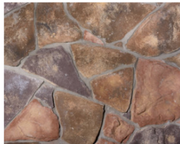
COUNTRY FIELDSTONE- OKLAHOMA BLEND