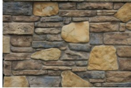
FRENCH COUNTRY- RUSTIC FOREST