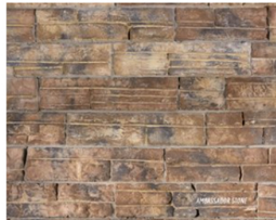
MT. LEDGE QUICKFIT- ROCKY MT. BLEND