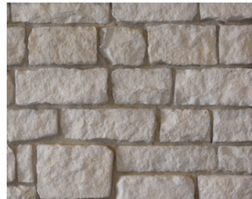
LIMESTONE - CHALK