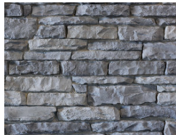
LEDGESTONE - WEATHERED GREY